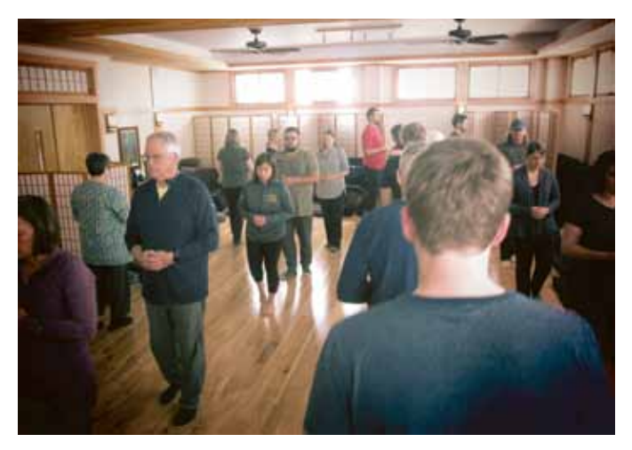
Walking meditation at our May retreat.