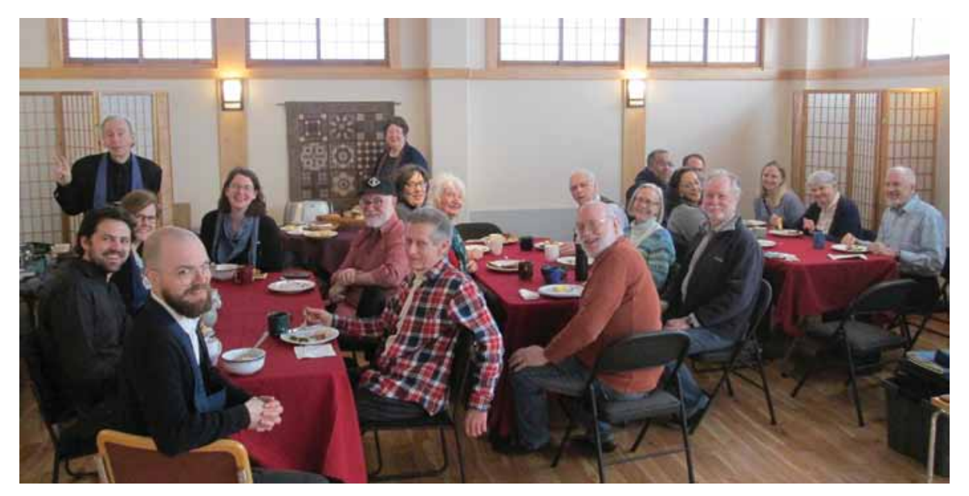
Community members enjoying brunch after our annual meeting in March.